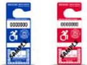
Apply for/renew disability placard