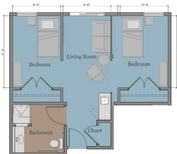
Private Double Suite with kitchenette