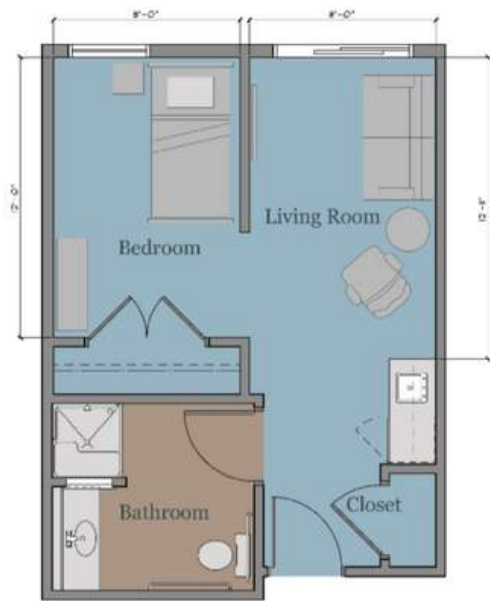
Private Suite with kitchenette