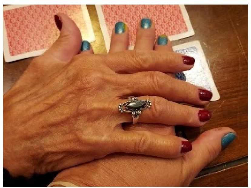
Very Thankful for our Multi-Generational Family here at Vicinia Gardens

What a Blessing to be a member of the Vicinia Family!!!