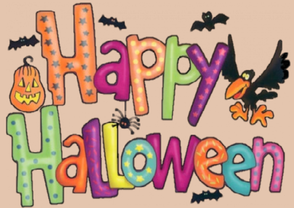
Photo Post Cards